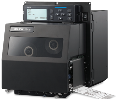
S84-ex RFID Print Engine