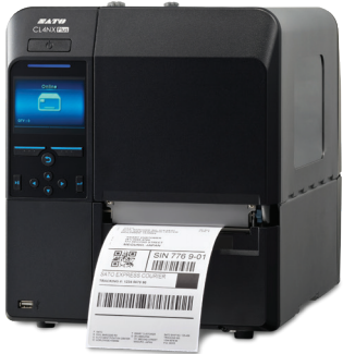
CL4NX Plus RFID