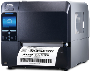
CL6NX Plus RFID