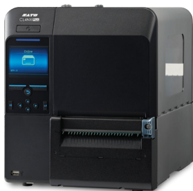
CL4NX Plus with cutter

Legend: Bolded Items denotes Standard/on-board Emulations: B=SBPL / Z=SZPL / I=SIPL / D=SDPL / T=STCL / E=SEPL Cutter: G=Gullotine / R=Rotary / P=Pulley Interfaces: S=Standard / O=Optional / P=Plug-in Interface (singular)