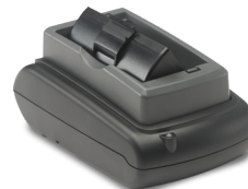
PV3 Battery Charger