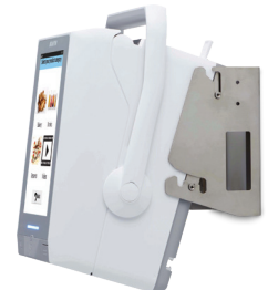
FX3-LX Mounting Station